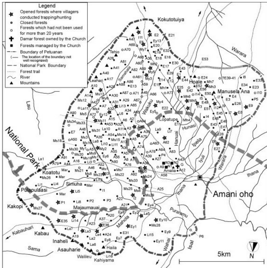
Fig. 3. Forest lots used for hunting and trapping in Amani oho territory.

However, we observed recent transformations in local forest resource management such as the application of sasi gereja (church prohibitions) on forest resource use.