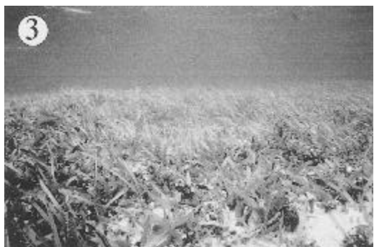
Fig. 3. Seagrass beds at St. 31 (Yap, 1.5 m depth)