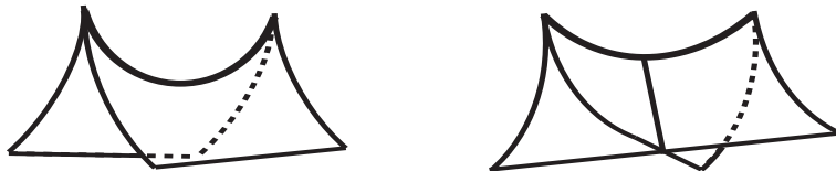
Figure 1: cuspidal edge and folded umbrella.

It is known, in the three dimensional Euclidean space, that the tangent variety (tangent developable) to a generic space curve has singularities each of which is locally diffeomorphic, i.e. right-left equivalent, to the cuspidal edge or to the folded umbrella, as is found by Cayley and Cleave ([6][7]).