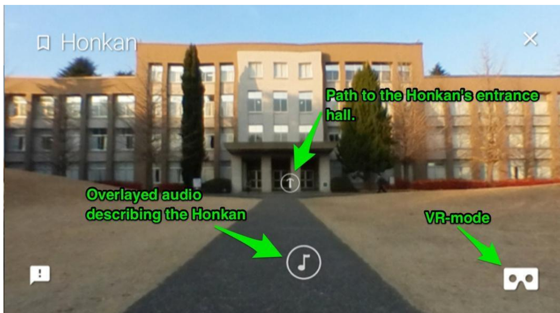
Figure 1. Mobile screenshot of Honkan or Main Building story sphere's main section.

The audio explanation hotspots, which replace the explanations tour guide would give during an actual campus tour, were produced as MP3 files for compression and platform compatibility purposes. A well-reviewed, but not exorbitantly expensive VR photo capturing device was also acquired for taking VR photos of the main areas of the campus. The story sphere was then embedded into the authors' seminar website, which can be accessed through this URL: http://www.edtechgroup.org .