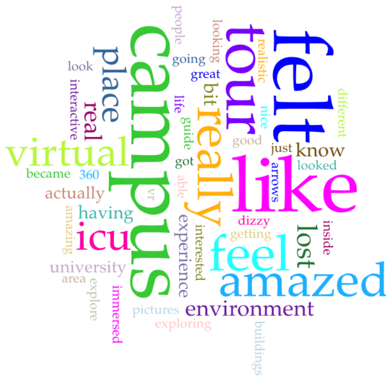
Figure 3. Word cloud of answers to how participants felt during the virtual tour