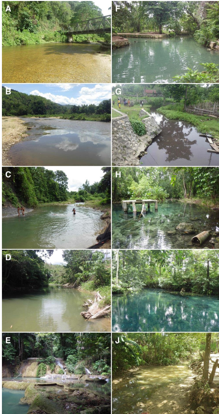
Figure 3. Pictures of collection localities. A. Sungai Ambekaeri, B. Sungai Asinua, C. Sungai Anduna, D. Sungai Moramo, E. Air Terjun Moramo, F. Oe Balano, G. Sungai Laweau, H. Motobano Oe, I. Fotuno Oe, and J. Sungai Waleale.