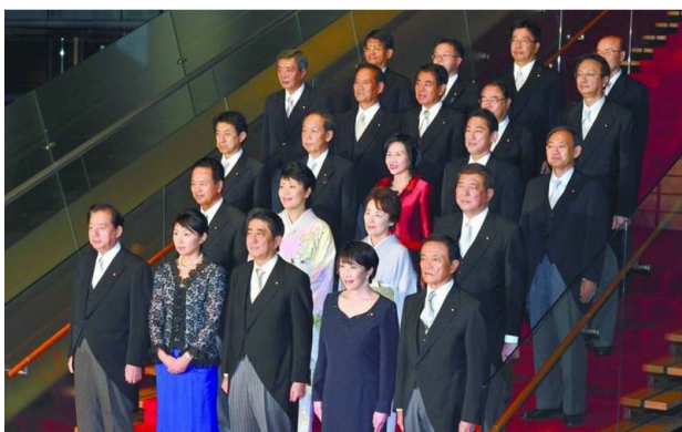
Womenomics in Japan: Five female ministers were appointed in the recent cabinet reshuffle in September 2014, but within a month two were forced to resign.

This strategy of empowering women has been dubbed “womenomics”. Abe himself started to implement “womenomics” by appointing five female ministers in his recent cabinet reshuffle on 3 rd September 2014.