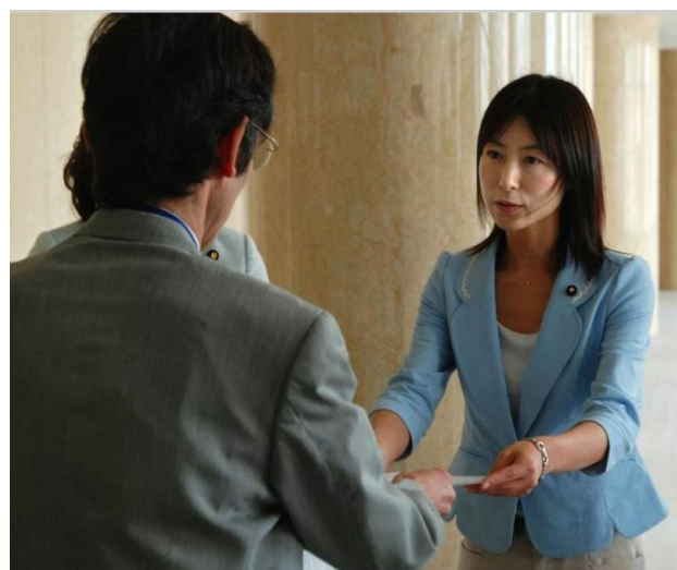
Shiomura Ayaka was harassed by a fellow member of the Tokyo Metropolitan Assembly while speaking on gender equality and maternity support (Japan Times)

However, his effort backfired as within a month two of the women were caught up in scandals and had to resign. On 20 th October 2014, justice minister Matsushima Midori had to step down after being accused of distributing handheld fans with her image to potential voters, which is considered an act of bribery. On the same day, Obuchi Yuko, minister of economy, trade and industry resigned over an alleged misuse of political funds (Aoki and Yoshida, 2014). The promotion of women to more powerful political positions is only slowly progressing.