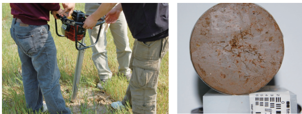
Fig. 1. Photos of soil core sampling (left) and surface image of the sample (right).

Our goal was to develop a portable in-situ soil texture classification system using image processing. Two alternative platforms were considered: a moving platform that took soil surface imagery traveling through the soil profile by incorporation of the sensor in another sensing system (e.g., cone penetrometer), or a stationary platform that captured surface imagery of soils obtained by a soil sampler (e.g., auger). Therefore, the image acquisition sensor for in-situ soil texture classification system needed to be smaller and lighter. After market survey, a magnification–controllable CMOS image sensor (Model: