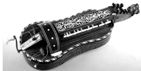
Fig. 4 Guitar-shaped vielle

Improvements were also made to the instrument's structure. One of the most notable was the enlargement of the wheel. Conventional wheels were cut from a single piece of wood and were limited to a diameter of less than 15 cm. This size limitation was intended to prevent distortion due to the effects of temperature and humidity, which made it technically difficult to increase the size of the wheel. In the 18th century, the traditional single-panel wheel was replaced by a multi-layered wheel, in which the effect of temperature and humidity on the wheel as a whole was mitigated by reducing the size of each piece of wood. As a result, wheels larger than the traditional ones emerged, with diameters of 17 cm or more than before (15) . The larger wheel also increased the contact surface between the wheel and the strings, allowing for more strings to be installed. Vielles made in the 18th century were strung with two melody strings and four drone strings, which not only allowed multiple drone sounds to be played simultaneously but also amplified the volume of the sound. Considering these acoustic effects, it is no exaggeration to state that the size of the wheel and development of musical instruments are closely related (16) .