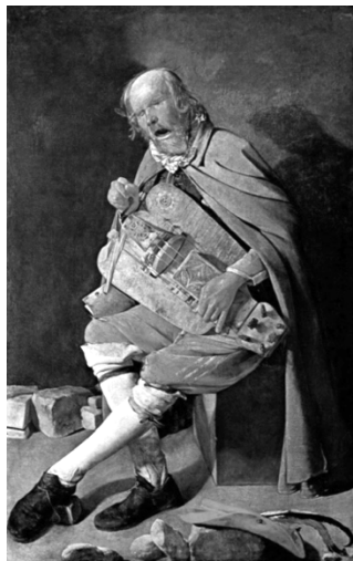
Fig. 1 Tulip-shaped vielle

The basic structure of the vielle and how it is played are as follows: the instrument has a central melody string and a drone string, and the keyboard is positioned so that only the melody string can be approached. Pressing the keys changes the length of these strings and determines the pitch of the notes. There is a separate sounding mechanism in which the strings are struck and sounded by rotating a wheel (a wooden disk) located next to the keyboard. When playing, the left hand controls the keyboard and the right hand controls the wheel.