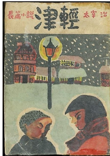
Second Edition Tsugaru , Maeda Shuppansha 前田出版社, 1946

The second printing of Tsugaru has a very different overall appearance just on the cover alone. On the top it is written “長篇小説 津軽 太宰治” meaning “Full-length Novel Tsugaru Dazai Osamu”. This establishment of Tsugaru as a full-length novel has been a very interesting point of debate in previous research as seen earlier. The picture which dominates the center of the cover, although attractive, does not