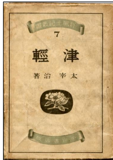
First Edition Tsugaru , Oyama Shoten 小山書店, 1944

As with Genette's fundamental ideas regarding paratext, some of the main questions of paratext are: for whom? by whom? for what purpose? A paratextual point of view will expand the options of how to read a work and interpret its destination. 14