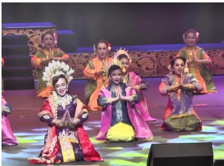
Figure 8: Mek Melung performed by The National Department for Culture and Arts in 2018