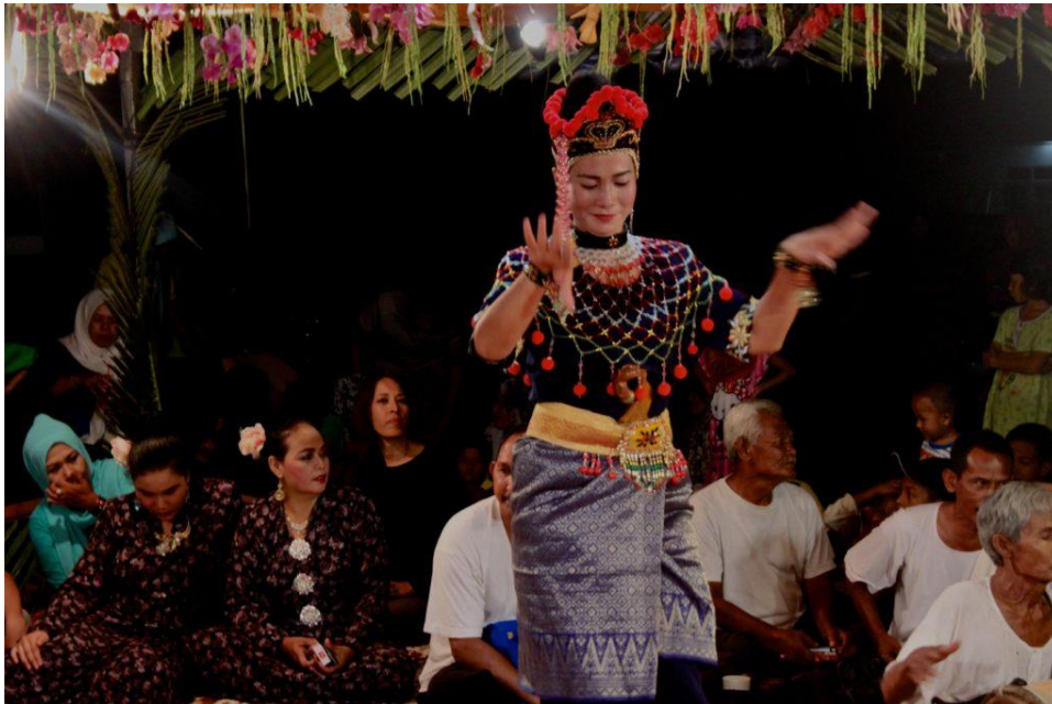
Figure 3 : Mak Yong (Makyung)

The Makyung tradition was preserved until the 1960 and 1970. Subsequently, the PAS (Malaysian Islamic Party), a political party in Kelantan that was influenced by the Islamic Revolution, came to power and banned the non-Islamic elements of traditional dance-drama performances.