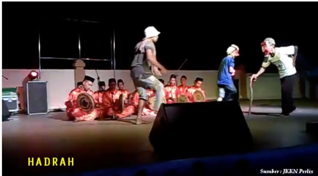
Figure 7: Hadrah in Perlis

in order to commence the dance. The dance tells the story of a woodcutter who has lost his way and wanders around, beats woods with a bamboo stick and praying, and returns village safely. This dance is said to have begun as a celebration of his return (Mohd Taib Osman 1982).