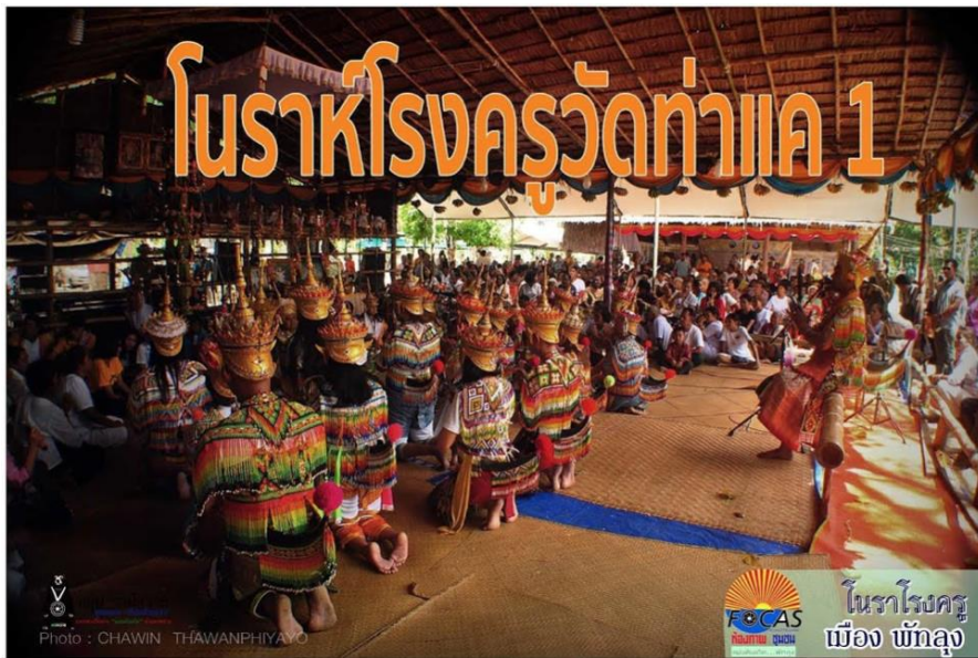
Figure 1: Norah at Ban Tha Khae in Phatthalung ( https://youtu.be/aQ6V1G4h_UI )