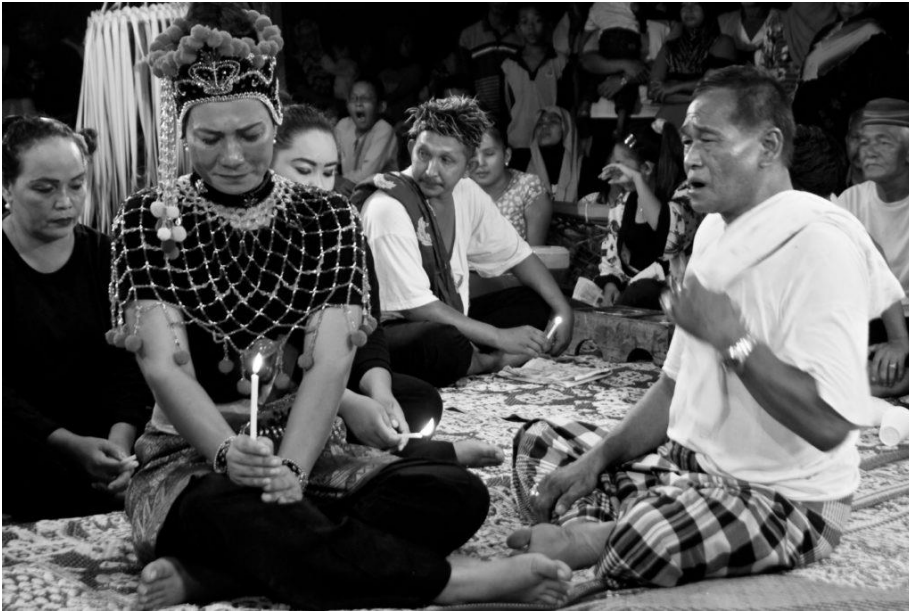
Figure 4: Mak yong in ritual

https://www.newmandala.org/mak-yong-in-may-sembah-guru/