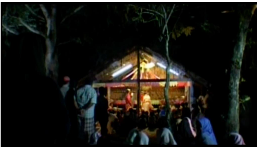
Figure 5: Mek Melung of Kg. Wang Tepus in Kedah