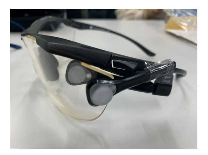
Figure 1. Eye dosimeter (DOSIRIS<sup>™</sup>) attached to the left side of the lead glass (inside and outside of the lead glass).

the occupational radiation dose to the lens of the eyes by calculating Pearson correlation coefficients using the total values of each parameter during the study period. The coefficient of determination for the linear regression equation ( R^2 ) was used to assess the goodness of fit.