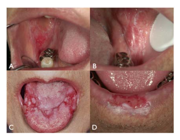
Figure 1. Clinical appearance of oral lichen planus (A, right buccal mucosa; B, left buccal mucosa; C, tongue; and D, lower lip) in patients at Saga University Hospital, Japan. White lace-like (reticular) lesions and erosions were observed on the buccal mucosae (A and B) of a patient with fatty liver and diabetes mellitus. Severe erosions with symptoms of contact pain on the tongue (C) of a patient with HCV-related liver cirrhosis and HCC, and erosion on lower lip (D) of a patient with chronic hepatitis C. HCV, hepatitis C virus; HCC, hepatocellular carcinoma.

oral cancer, SVR leads to substantial reductions in extrahepatic manifestations such as cryoglobulinemia vasculitis, malignant B-cell lymphoproliferative diseases, insulin resistance, diabetes, mixed cryoglobulinemia, and glomerulonephritis (77,78).