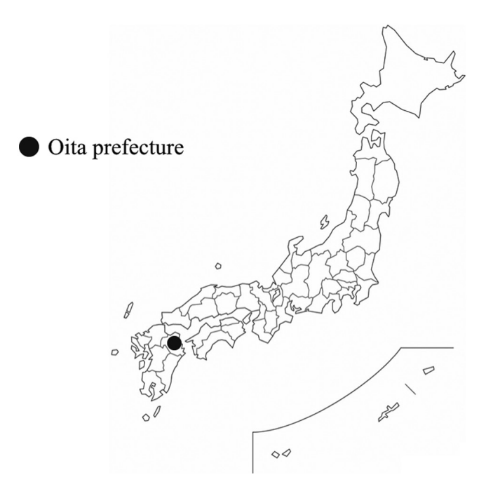
Figure 1. Map of Japan; the black circle indicates the Oita Prefecture. Blank map of Japan from the map software CLIP MAPIO JAPAN, printed with permission from the DesignEXchange Co., Ltd.

Screening for viral hepatitis (anti-HCV, HBsAg and anti-HBs). The serum antibody to HCV (anti-HCV) levels were measured using a fully automated chemiluminescent enzyme