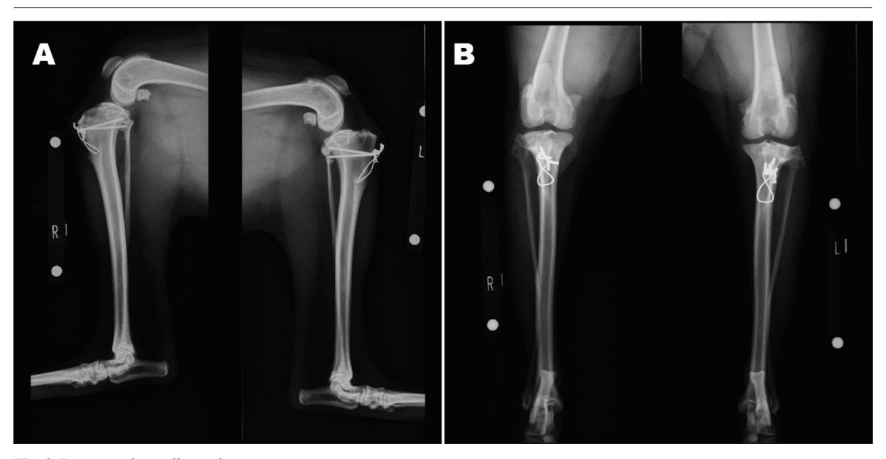
Fig. 3. Postoperative radiograph.

increase in O angle, dysfunction of the vastus medialis muscle, and overstrained external tissues. If the muscles and ligaments on the outside of the patella are strained, and a force is applied to pull the patella outward, making it more likely to dislocate, leading to X-linked knee (Mizuno et al., 2001; Schneider et al., 2016; Aframian et al., 2017; Chahla et al., 2019). We did not detect dysplasia of the femoral condyle. Although the median O angle was 8.7° (range: 2.7°-14.8°) in large breed dogs (Pinna and Romagnoli, 2017), the patient's Q angle, in our case, was 43.37° on the right and 32.15° on the left, leading to X-linked knee. Thus, the application of MPFL might be an adequate surgical technique for the patient. Although in our case, we did not apply the device of MPFL used in human medicine (Tucker et al., 2018), a 40-medium suture was employed. In this case, the patient did not show lameness, implant failure, pain, and re-luxation after surgery. This suture might be effective for modified MPFL reconstruction in canine LPLs.