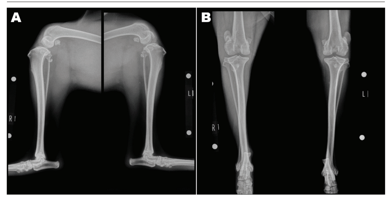
Fig. 1. Preoperative radiograph. Severe bilateral LPL was detected.